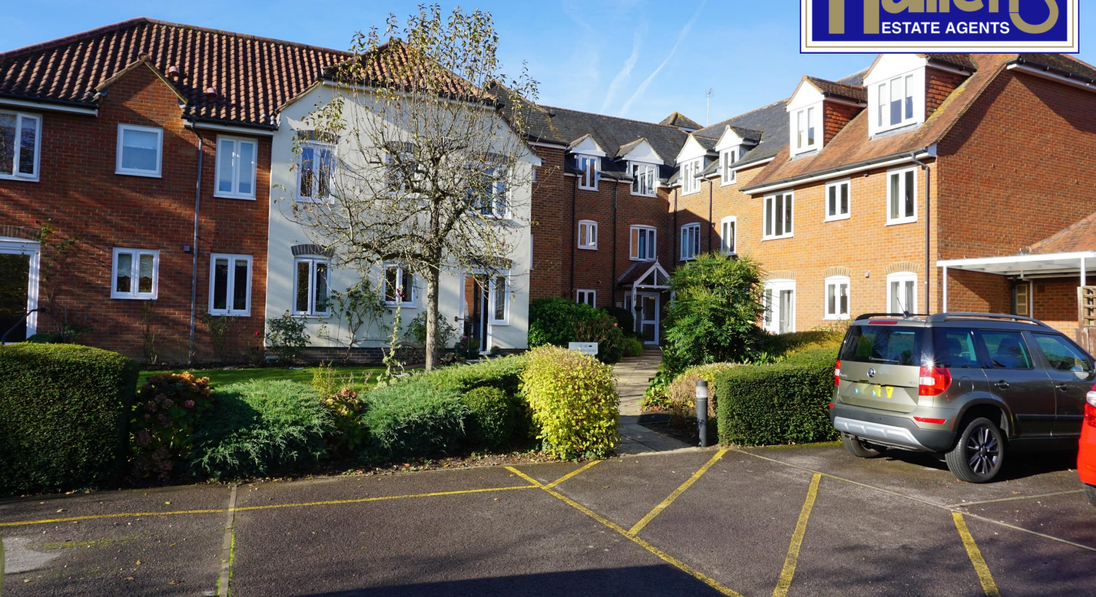
39 Mallard Court West Mills Newbury RG14 5HL